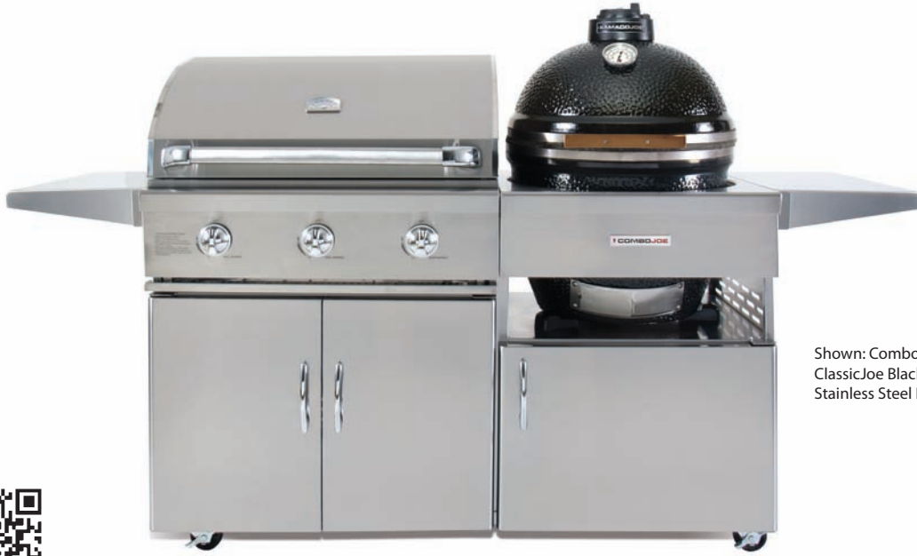
Shown: ComboJoe 32" with ClassicJoe Black Stand Alone with Stainless Steel Bands & Hinge