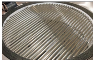
Upper Cooking Grate with Both Sections Inserted