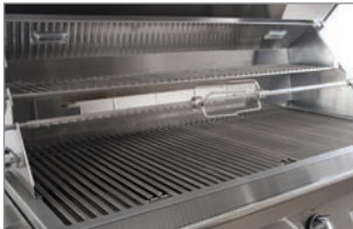
8mm Cooking Grate Rods with Rotisserie and Warming Rack

GasJoe Ultra Specifications | KamadoJoe.com/gasjoe_ultra.html