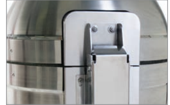
Perfectly Counterbalanced Hinge with Static Positioning as low as 10°

KamadoJoe Specifications | KamadoJoe.com/projoe.html