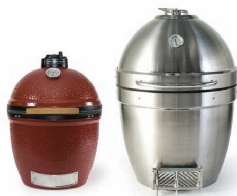
Size Comparison of ClassicJoe and Projoe