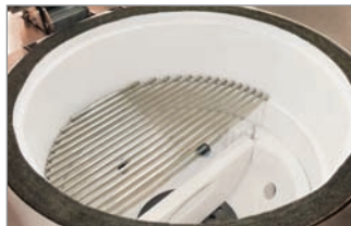
Two-Piece Design 3/8" 304 Stainless Steel Upper and Lower Cooking Grates