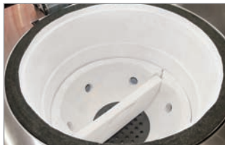
Fire Box Divider for Higher Fuel Efficiency or to Create Separate Cooking Zones