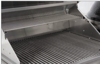
8mm Cooking Grate Rods with Warming Rack

KamadoJoe Specifications | KamadoJoe.com/combojoe.html