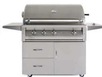
GasJoe Ultra 42"