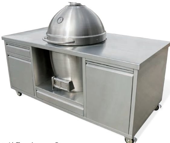
Pro Joe Cart with Three Accessory Drawers and Charcoal Storage Cabinet