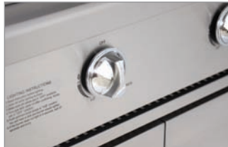
Polished Accent Knobs and Handles