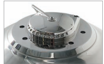
Investment Cast 304 Stainless Steel Top Vent with Mirror Finish