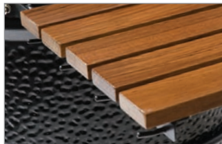
Finished Bamboo Side Shelves with Utensil Pins (4 Each Side Shelf)