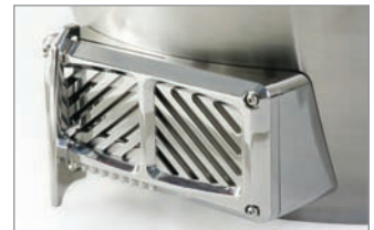
Investment Cast 304 Stainless Steel Draft Door with Mirror Finish