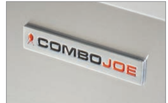
Premium Stainless Steel Finishing