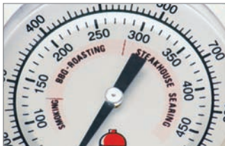
Extra Large Thermometer for Readability

BigJoe Specifications | KamadoJoe.com/classicjoe_bigjoe.html