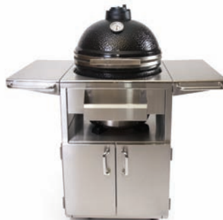
ClassicJoe Black Stand Alone with Stainless Steel Bands & Hinge in Stainless Steel Cart