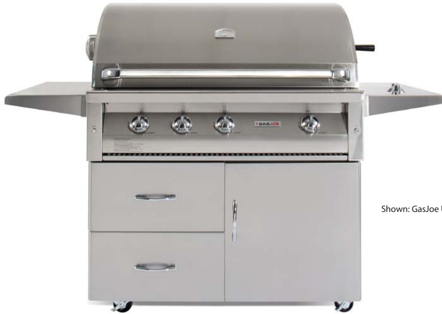
Shown: GasJoe Ultra 42"