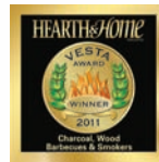
2011 Vesta Award Winner