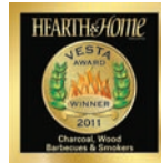
2011 Vesta Award Winner