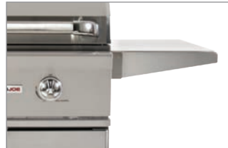
Removable Side Shelves