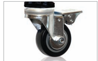
Oversized Locking Caster Wheels for Stability and Easy Movement