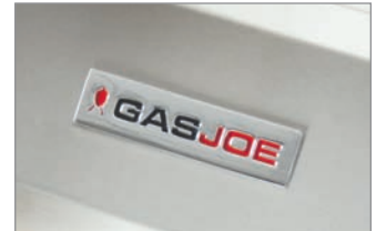
Premium Stainless Steel Finishing