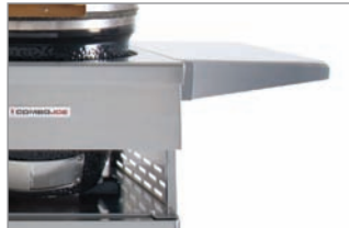
Removable Side Shelves