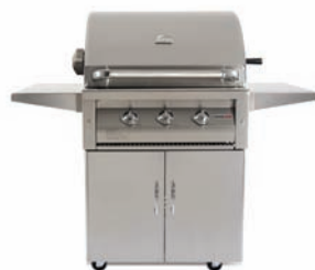
GasJoe Ultra 30"