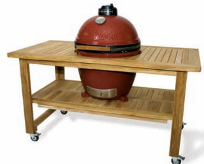
ClassicJoe Red Stand Alone with Black Bands & Hinge in Teak Grill Table