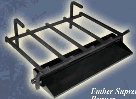
Ember Supreme Burner

Mountain Timber's unique paint scheme and gnarled log shapes create a distinct likeness of high-country timber. Utilizing a new paint process and our time-tested craftsmanship, Mountain Timber has crisp, incredibly fine detail on its massive, rounded logs, and was created to fit our deeper Ember Supreme burner system, which offers taller flame patterns from an oversize single burner design. 2004 Vesta Award Finalist.