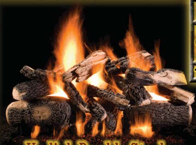
Kodiak Double Stack

Kodiak series vented logs feature two styles of massive logs for large fireplace applications, designed in combination with our Double-Stack™ and Triple-Stack™ burner systems, and were 2008 Vesta Award Finalists.